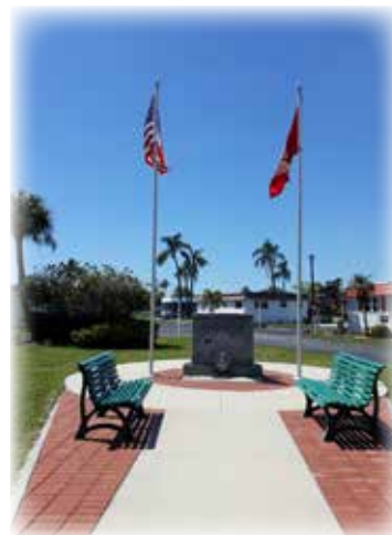
Submitted by the daughter of a veteran